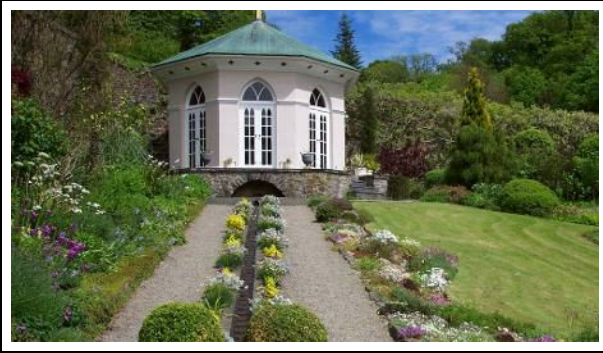
The Gazebo in Golby Woodland Gardens

We are now in British Summer Time and we are starting the Saturday Socials from April.